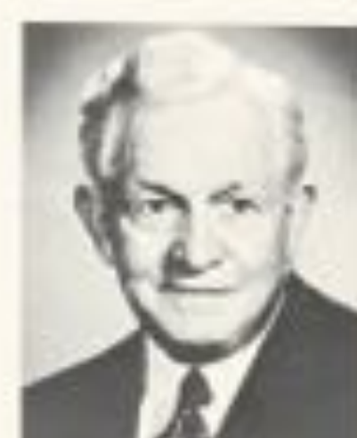
DAVID O. MCKAY