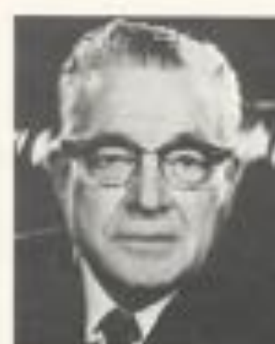
HAROLD B. LEE