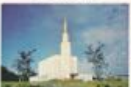
THE SALT LAKE TEMPLE SALT LAKE CITY, UTAH Dedicated 21st May 1893