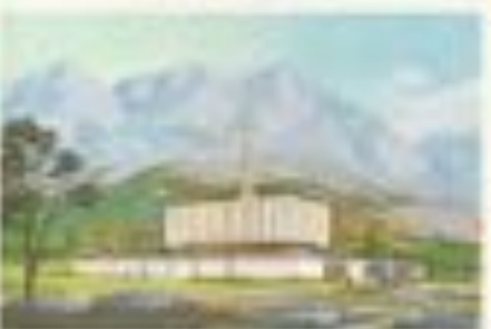
THE SALT LAKE TEMPLE SALT LAKE CITY, UTAH Dedicated 21st May 1893