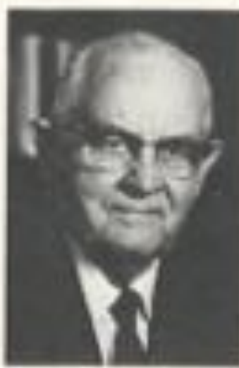
SPENCER W. KIMBALL