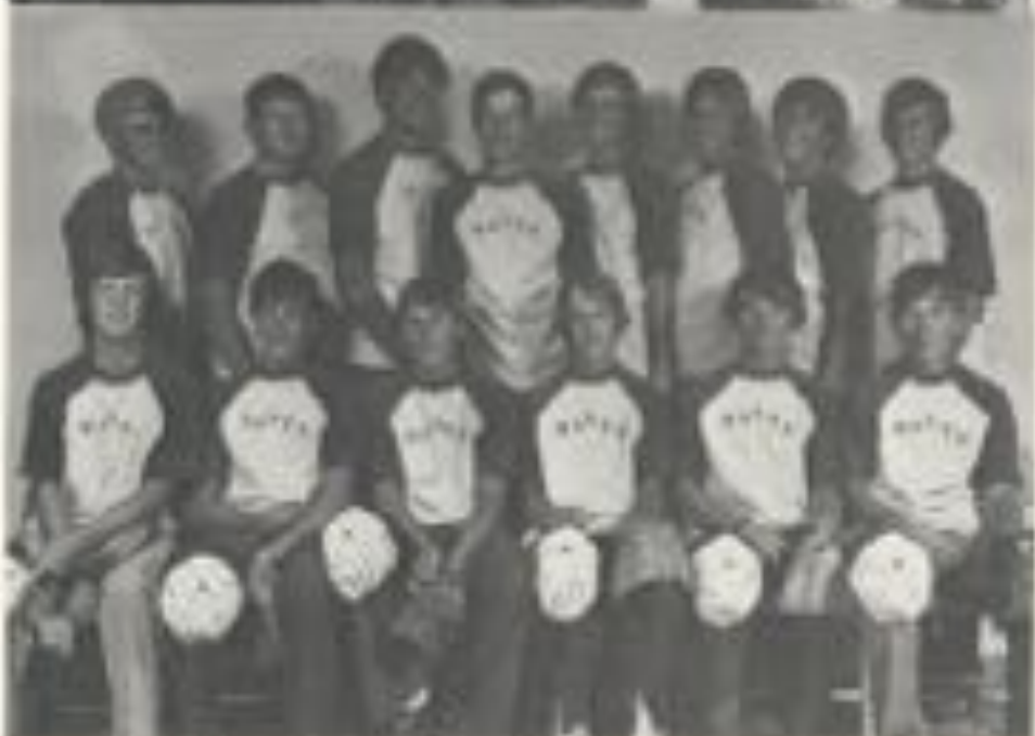
Malta Ward Junior Boys Softball Team - Ventures Malta Ward Junior Boys Softball Team