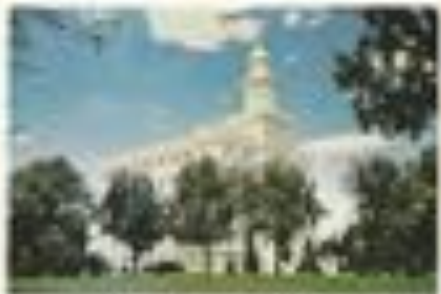
THE SALT LAKE TEMPLE SALT LAKE CITY, UTAH Dedicated 21st May 1893