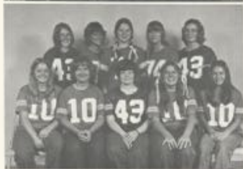
C & T Women's Softball Team R. E. A. Women's Softball Team Maite Weed Girls Softball Team