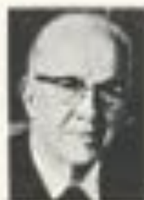
EZRA TAIT BENSON