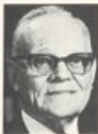
MARION G. ROMNEY