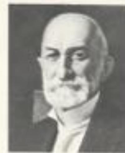
HEBER J. GRANT