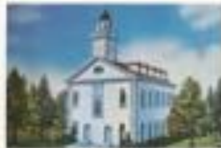
THE PORTLAND TEMPLE PORTLAND, OREGON Dedicated 12th October 1958