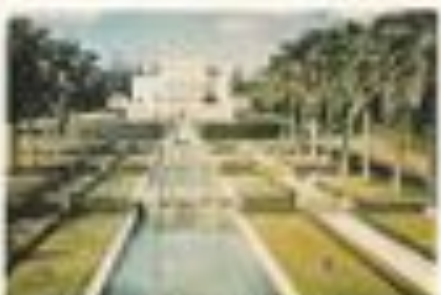
THE WASHINGTON TEMPLE WASHINGTON, DISTRICT OF COLUMBIA Dedicated 22nd November 1957