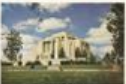
THE SALT LAKE TEMPLE SALT LAKE CITY, UTAH Dedicated 21st May 1893