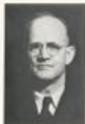
1957 1959 Orono of Orono