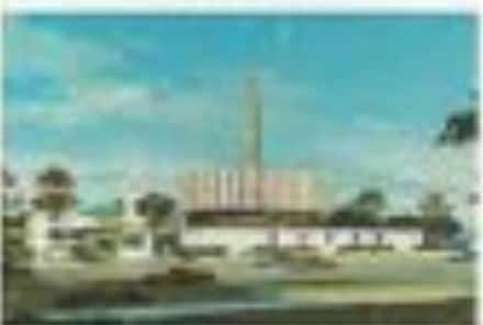
THE SALT LAKE TEMPLE SALT LAKE CITY, UTAH Dedicated 21st May 1893