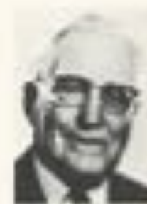
HUGH B. BROWN