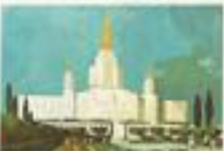
THE DENVER TEMPLE DENVER, COLORADO Dedicated 12th October 1958