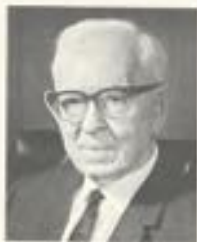
JOSEPH FIELDING SMITH