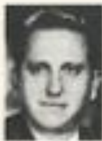
THOMAS S. MONSON