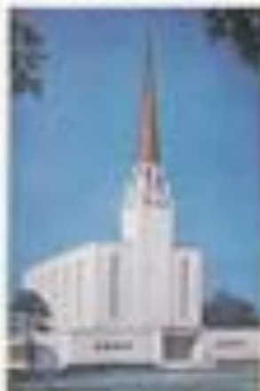
THE BOSTON TEMPLE BOSTON, MASSACHUSETTS Dedicated 1st October 1957