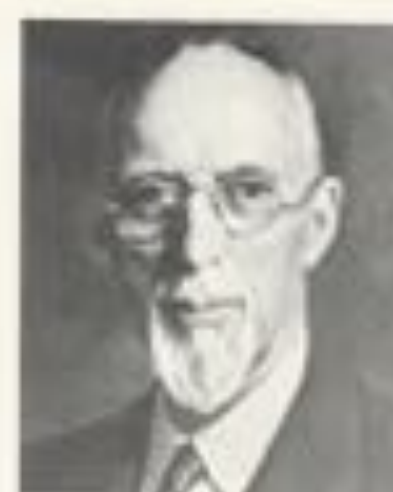
GEORGE ALBERT SMITH