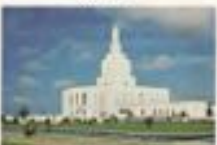
THE SALT LAKE TEMPLE SALT LAKE CITY, UTAH Dedicated 21st May 1893