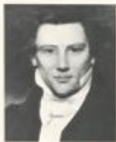
JOSEPH SMITH, JR.