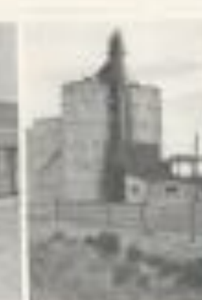
Malta Post Office New Post Office First Church Malta Service Store Malta Cafe Malta River Park Station Supermarket, Inc. General Mills