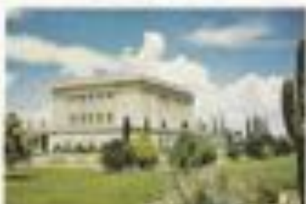
THE ASTORIA TEMPLE ASTORIA, OREGON Dedicated 22nd October 1957