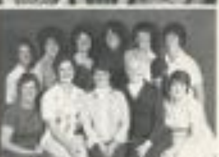
Building Fund Committee Music Dept. Sunday School Music Sunday School Secretary