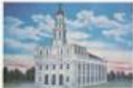
THE KALAMAZOO TEMPLE KALAMAZOO, MICHIGAN Dedicated 1st April 1958