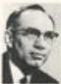
GORDON B. HINCKLEY