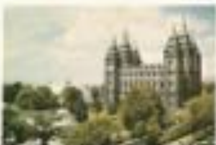
THE LAS VEGAS TEMPLE LAS VEGAS, NEVADA Dedicated 12th November 1957