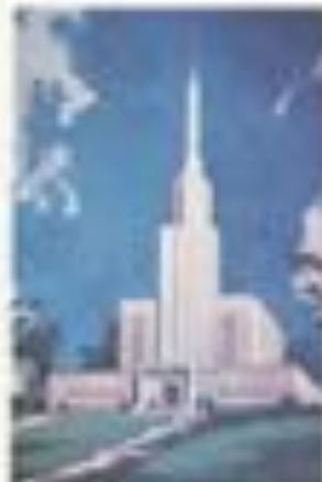
THE NEW ORLEANS TEMPLE NEW ORLEANS, LOUISIANA Dedicated 12th May 1958