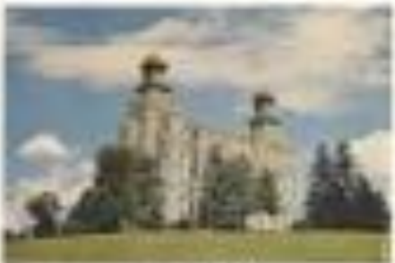
THE SALT LAKE TEMPLE SALT LAKE CITY, UTAH Dedicated 21st May 1893