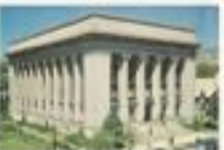
THE SALT LAKE TEMPLE SALT LAKE CITY, UTAH Dedicated 21st May 1893