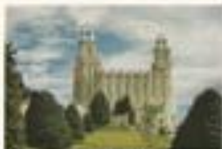
THE SALT LAKE TEMPLE SALT LAKE CITY, UTAH Dedicated 21st May 1893